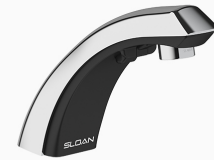
Variation not shown: 8" Trim Plate